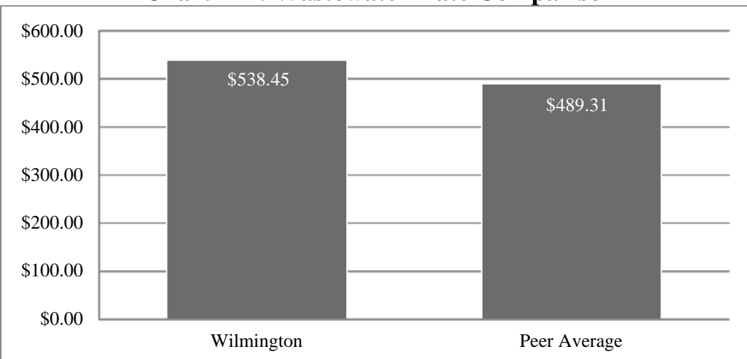
Chart B-2: Wastewater Rate Comparison

Source: Wilmington and the peer cities of Bucyrus, Celina, and Norwalk