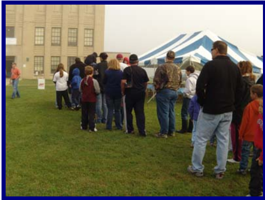
Photo No. 5 –Each person had to sign in prior to taking the plant tour.

In addition to the fishing extravaganza, the District's staff provided guided and informative tours at regularly timed intervals throughout the day. These tours were well received by the nearly 1,000 people who came to visit our facility to participate in the day's activities. The day was a grand success with 2,000 people touring and fishing at Meander Lake.