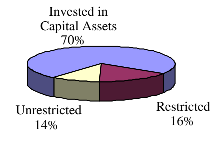
Net Assets as of June 30, 2006

Net assets include the net investment in capital assets and both restricted and unrestricted funds. Total net assets increased .7% from FY 05 to FY 06.