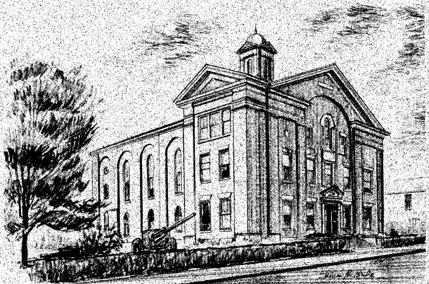
Pike County Courthouse Waverly, Ohio