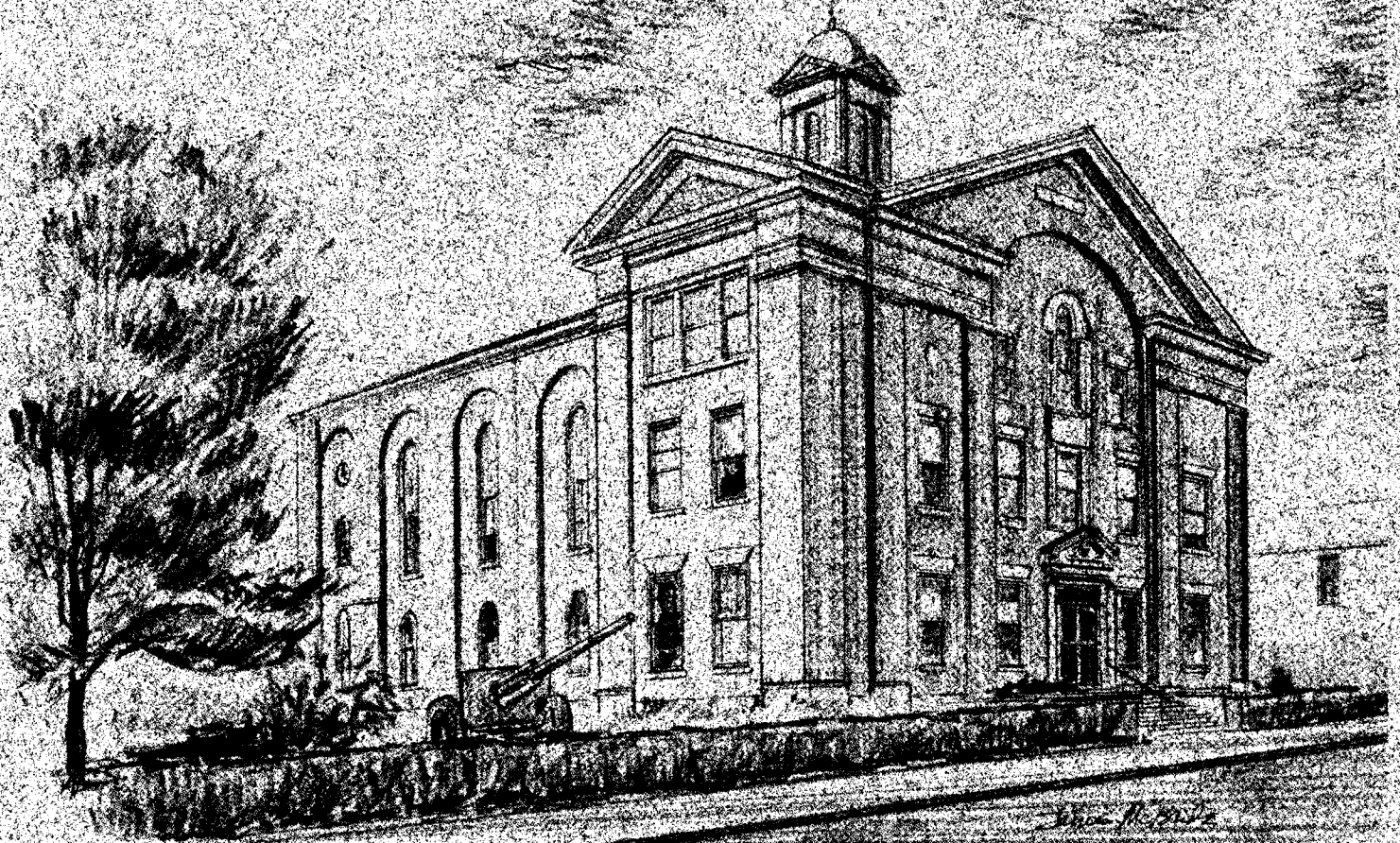
Pike County Courthouse Waverly, Ohio