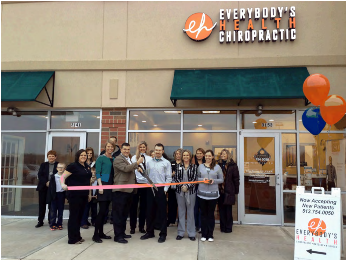
Everybody's Health Chiropractic opened their Monroe location in the Heritage Green Plaza in 2012. The Heritage Green Plaza is now fully occupied.